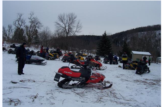
Trails held up well considering all the traffic they saw over the weekend.

Congratulations go out to all the winners of the door prizes and the 50/50 winner! More than 40 members took part in the Club ride!