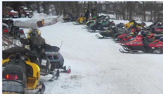
Many snowmobiles joined in the ride.