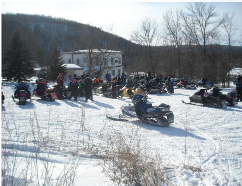
First arrivals at the Maple Inn, East Berne.