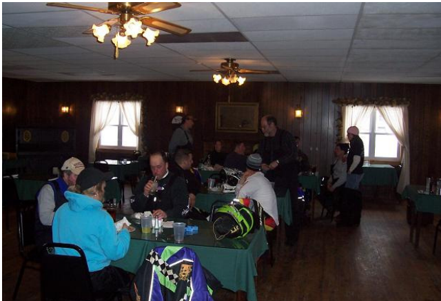
Club members enjoy hot wings and pizza!