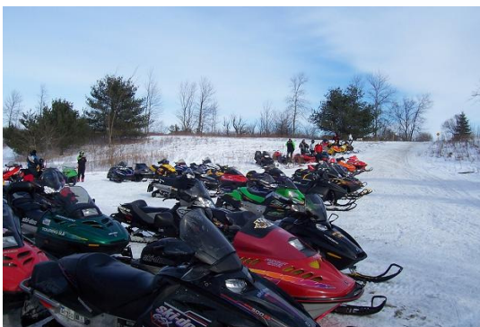
Near perfect weather for riding!