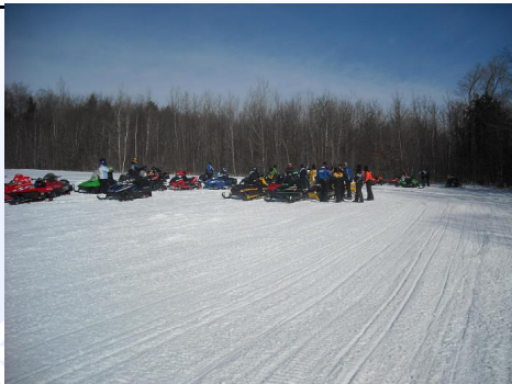
Rally point at Blue Heron Airport.