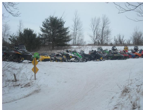
Everyone now went inside....