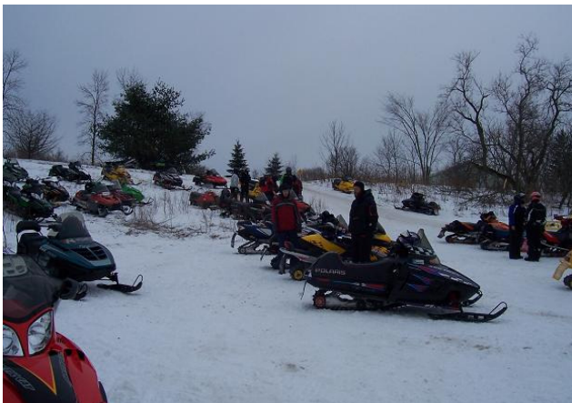
Riders from up north prepare to head back toward home.