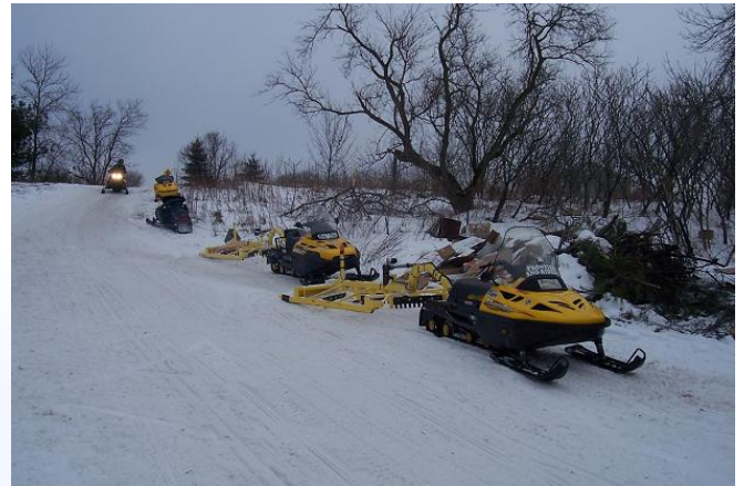
The groomer sleds saw extra duty before the ride.