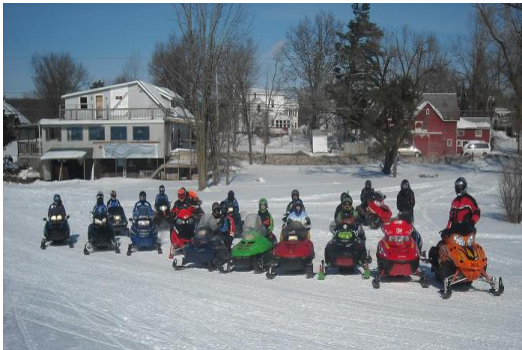
Club Ride getting under way at Jonathan's.